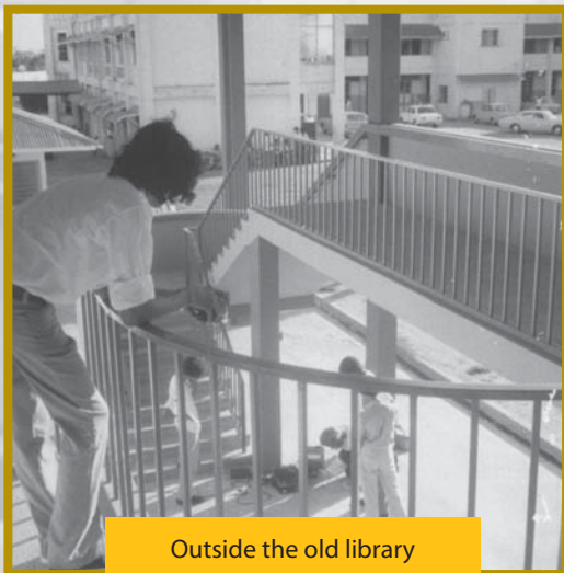
Outside the old library