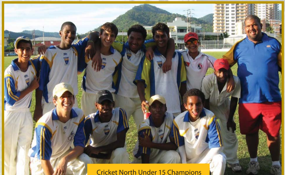
Cricket North Under 15 Champions

Then on Thursday 9th June 2011, at Fatima College grounds, they defeated St. Anthony's College by 34 runs to win the North Under-17 Championship. Congratulations guys!