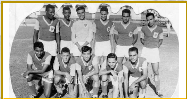
Editor's note submitted on picture from Newsletter #6

The above picture was posted in the last issue as '1963-64 First Eleven'. We were happy to have received the following information from FOBA Historian, Keith Simpson, who was able to identify the picture.